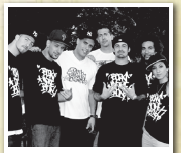
ROCK STEADY CREW